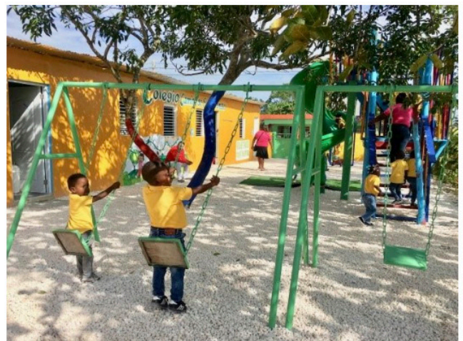
Camino de Esperanza after reconstruction.