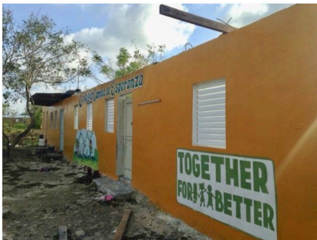
After hurricane, before reconstruction, no roof.

Reconstruction & repairs, Post Hurricanes: Hurricane Maria (fall 2017) left the Camino de Esperanza School without roof. Repairs were finalized in February 2018. Minor repairs were finished in three additional schools February.